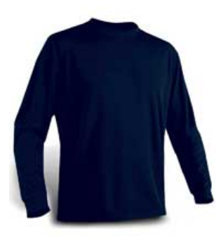
<u>Logo Specs:</u> Embroidered "Spitfires" logo – Left chest